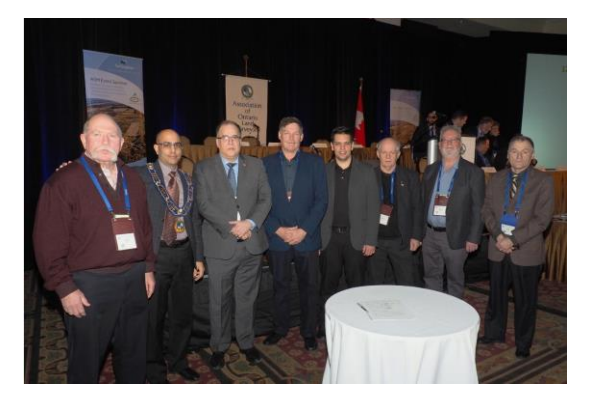
Group Photograph, Signing of the Memorandum of Understanding to formalize commitment to work on national issues was signed by representatives of the other provincial surveying associations and the Association of Canada Lands Surveyors (ACLS) (2/28/20)

It was my pleasure to represent our association at AOLS AGM in Huntsville, Ontario. The meeting was well attended, and it was a pleasure to see over a dozen new surveyors obtain their certificates. I did see some items that I hope to add our 2020 AGM. The issue of finding qualified staff was brought to the floor by the membership. Enrollment in geomatics/surveying programs is down across the country and many feel this will create significant issues to our profession in the not too distant future. This was also a topic brought up at the presidents meeting.