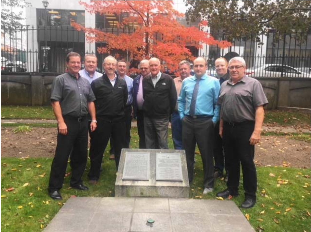
Department of Natural Resources Land Surveyors gather at the 1967 Centennial monument on the grounds of Provincial Legislature. (October 25, 2017)